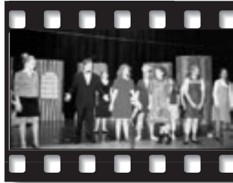
"Annie, Jr." rehearsal at Franklin Middle School March 19, 2007. You can see the overhead "track" and the new black velourette stage curtains purchased with funds from the School District #564 Music Budget and a grant from the TRF Education Foundation.

Close Up Trip ~ LHS. A study of the government.