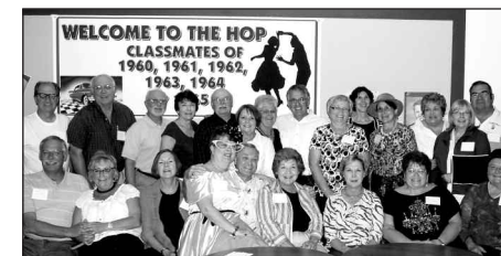
Classes of 1960, 61, 62, 63, 64 and 65