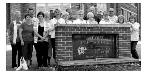
Class of 1969