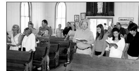
Class of 1979