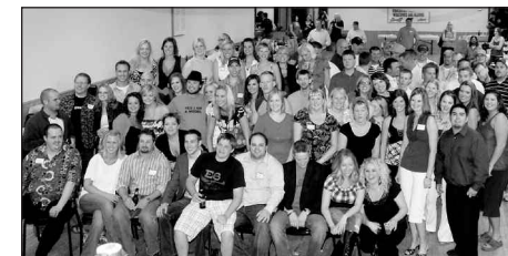
Class of 1999

A Newsletter for Alumni, Staff and Friends