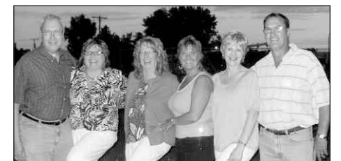
Class of 1974