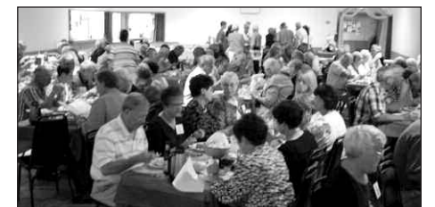
Class of 1959