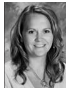
Thief River Falls public schools.