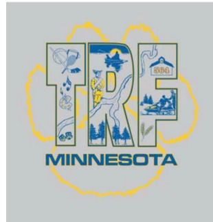
Crew Neck Sweatshirt or Hoodie